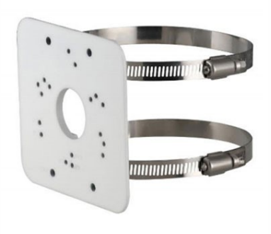
CP-UA-B2P Pole Mount