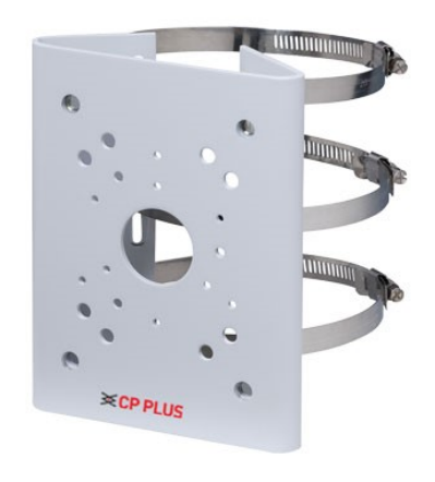
CP-UA-B3P Pole Mount Bracket