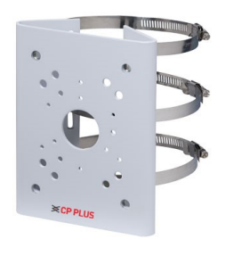
CP-UA-B3P Pole Mount