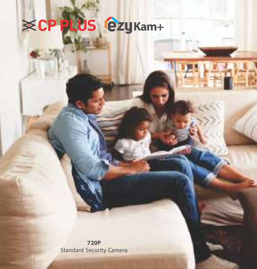
720P Standard Security Camera