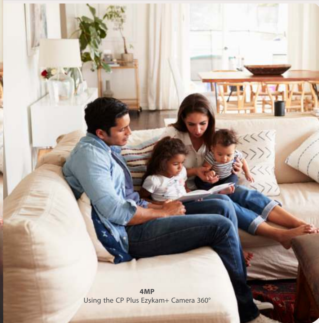
4MP Using the CP Plus Ezykam+ Camera 360°