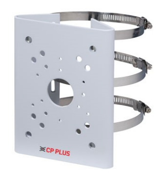
CP-UA-B3P Pole Mount Bracket