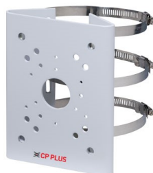
CP-UA-B3P Pole Mount

CP PLUS (Aditya Infotech Ltd.) F-28 Okhla Industrial Area, Phase 1, New Delhi 110020, INDIA