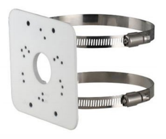
CP-UA-B2P Pole Mount