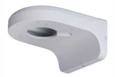
CP-UA-B06DW Wall Mount