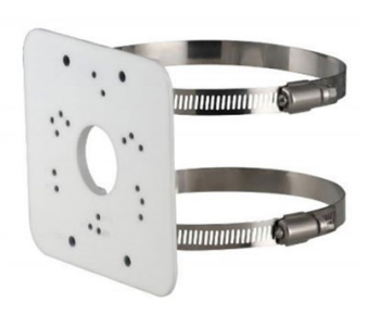
CP-UA-B2P Pole Mount